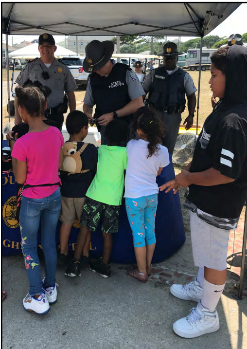
CROs Discuss Motorcycle Safety During Bike Weeks at Myrtle Beach During Month of May