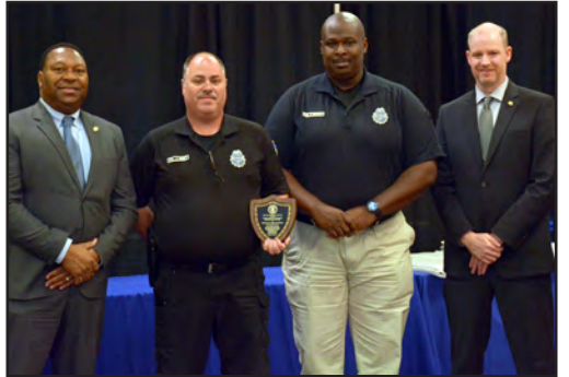
South Carolina Law Enforcement Network Award: 15th Circuit