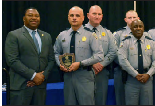
Highway Patrol Troop of the Year: Troop 5