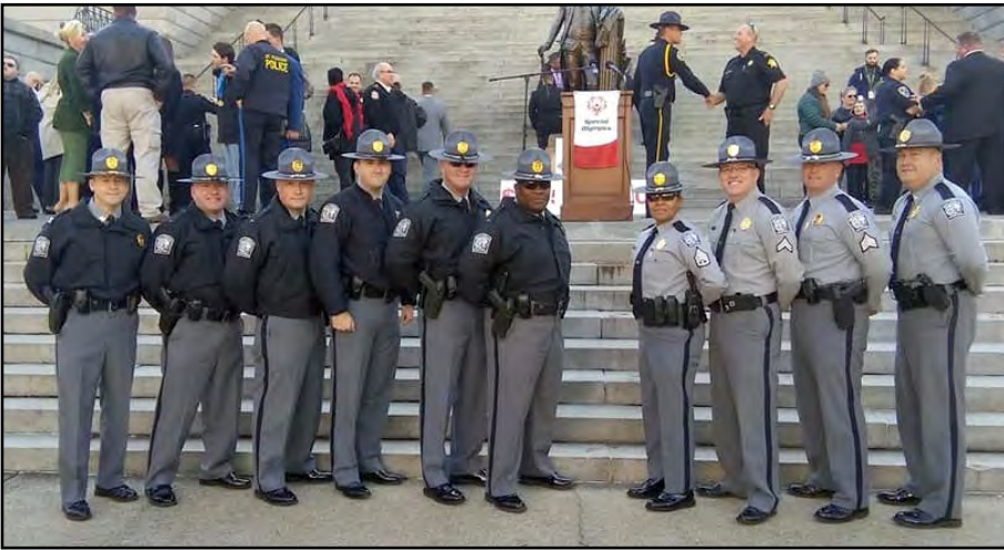
SCHP Troopers from around the state

The South Carolina Law Enforcement Torch Run for Special Olympics kicked off at the Statehouse on January 16, 2019. The event included several guest speakers from law enforcement agencies from around the state.