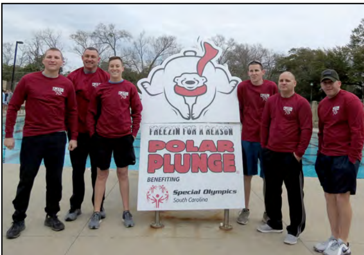
Troop 1 took part in the Gamecock Polar Plunge at Maxcy Gregg Park