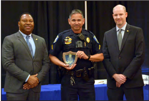
Agency of the Year: 101 or more officers: Mt. Pleasant Police Department