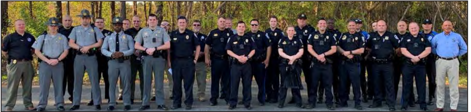
On March 23, 2019, these dedicated 9th Circuit Law Enforcement Network Officers worked together to keep our roadways safe. These efforts are being held in conjunction with the #WalkLikeMADD event in hopes of putting a stop to impaired driving. #SoberorSlammer