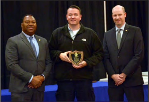
Agency of the Year: 51-100 officers: Mauldin Police Department