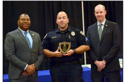
Agency of the Year: 26-50 officers: Bluffton Police Department