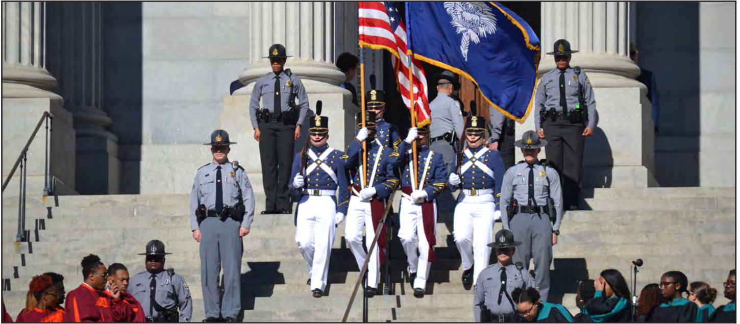
SCDPS law enforcement, including Bureau of Protective Services, Highway Patrol and State Transport Police assisted in providing safety and security during Gov. Henry McMaster's Inauguration Ceremony on January 9.