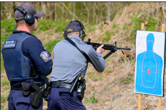
SCDPS troopers and officers training with new rifle.

SCDPS has recently introduced two new tools that will enhance safety for both our law enforcement and the public.