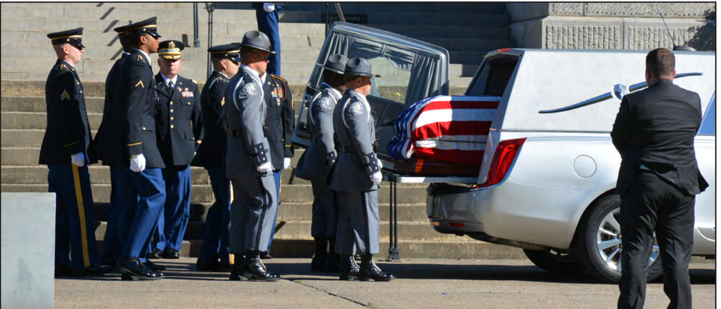
SCDPS Honor Guard members assist in the escort of Sen. Ernest "Fritz" Hollings' body into the State House for the lying-in-state on April 15, 2019. Hollings served in Congress from 1966 to 2005 and prior to serving as a U.S. senator, Hollings also served as South Carolina's lieutenant governor from 1955 to 1959, and as governor from 1959 to 1963.