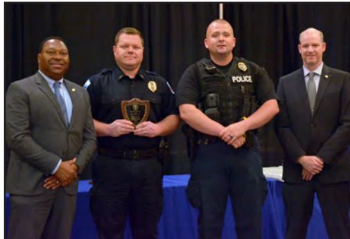
Agency of the Year: 1-10 officers: Chapin Police Department