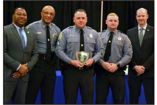
State Transport Police District of the Year: Region 3